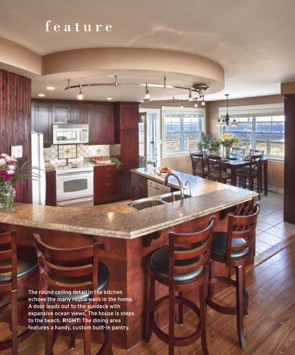
The round ceiling detail in the kitchen echoes the many round walls in the home. A door leads out to the sundeck with expansive ocean views. The house is steps to the beach. RIGHT: The dining area features a handy, custom built-in pantry.