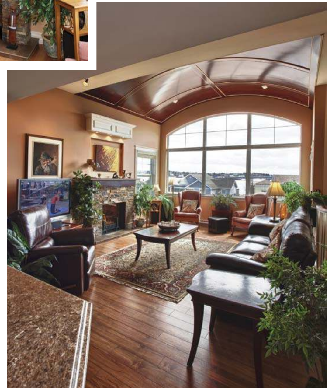
OPPOSITE TOP: With the turret, decks, large windows and beach right behind, it’s easy to see why Pierre and Kate were attracted to this unique beach home. OPPOSITE BOTTOM: The main entrance is sunny, casual and practical. Come in and kick off your flip flops here! TOP LEFT: The gas fireplace keeps the home cosy on cold nights. TOP RIGHT: The bathtub in the dramatic master suite looks out at the beach and ocean beyond. ABOVE: A recessed compass rose is positioned in the ceiling above the staircase. RIGHT: The living room offers huge windows and a striking panelled ceiling.