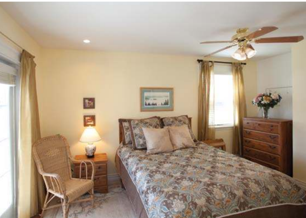
LEFT: All of the guest rooms are on the ground floor. This one has double patio doors that lead to the front deck. BELOW LEFT: This light and airy guest room looks out below the back deck toward the beach. BELOW RIGHT: This sweet room is decorated for Pierre and Kate’s granddaughter.

“We love this neighbourhood and the whole area,” says Pierre. “There’s no pollution, no other smells except the great smell of the salt water, and it’s quiet.” Adds Kate, “We are centrally located so that we can travel anywhere and it’s a great place to retire.” OH